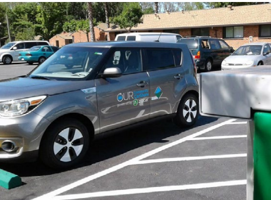
A Kia Soul Zipcar is one of eight electric vehicles available for residents of three Sacramento affordable housing communities. The communities and the Sacramento train depot are also receiving electric vehicle charging stations.