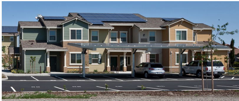
Spring Lake Solar Feature