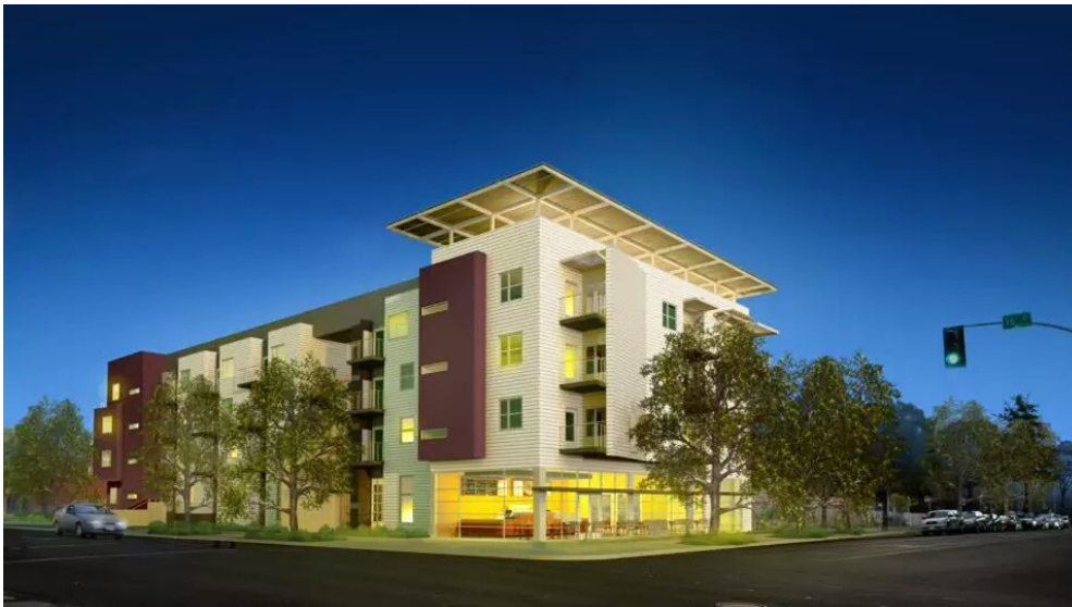
A rendering of Lavender Courtyard, a 54-unit project of about 25,600 square feet planned for the southeast corner of 16th and F streets.

According to the project narrative in the city application, the mixed-use project would be four stories and include an 863-square-foot commercial space on the corner. The building would surround a courtyard with a barbecue area, fountain, bicycle parking and landscaping.