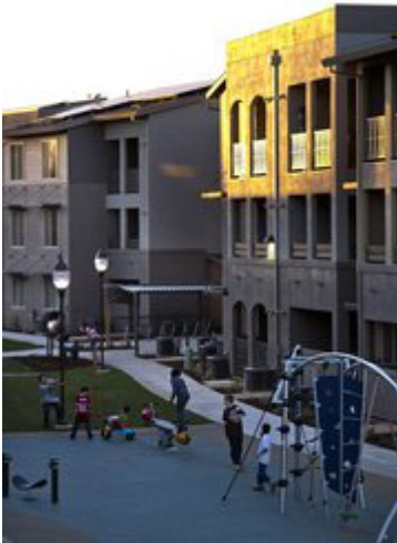
A play area is one of the features at the New Harmony Mutual Housing Community in south Davis, which opened Feb. 1.