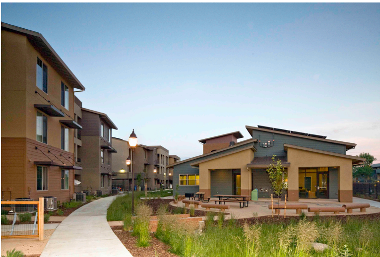
The commons area at New Harmony Mutual Housing in South Davis is a popular gathering place. The development was awarded the title of “Best Community Project” in Green Builder Media’s sixth annual awards competition.